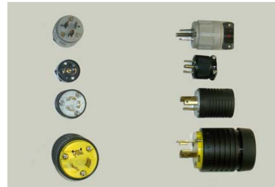
Standard 110v Plug

For your reference, 3 of the common size connectors are shown below. (The standard 110v is shown to assist you in establishing sizes.)