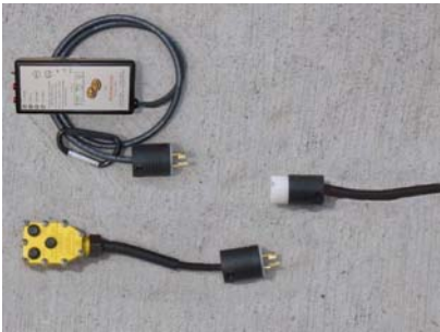
Connectors attached to Autopuller, original pull head and cord.

The Autopuller was designed to be used with either your existing pull cord or a external grade extension cord. If you use the existing cord, remove the head from the cord and install a female connector in its place. A mating male connector is installed on the original head and on the Autopuller. This will allow you the choice of either control unit. If you decide to replace the pull cord with an exterior grade extension cord, install the necessary connectors on the cord and on the Autopuller. See installation for wiring instructions.